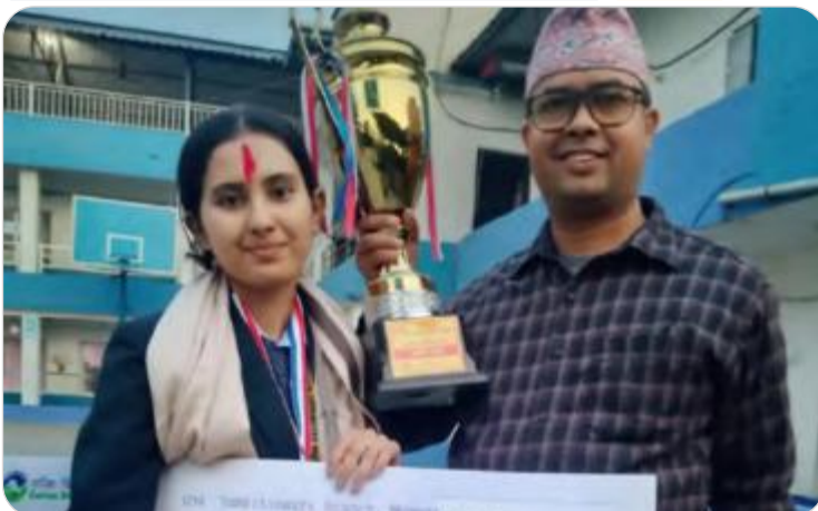
Winner of District Level Speech Competition