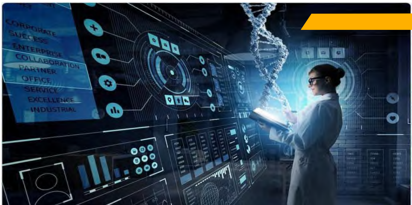
Proposed Chemistry Lab