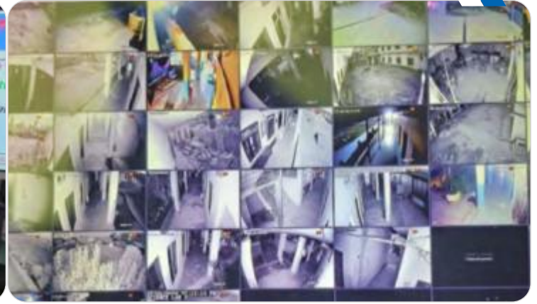
24 Hours CCTV Surveillance