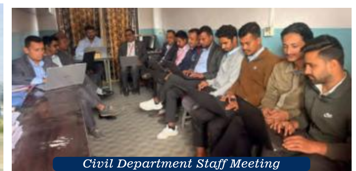
Civil Department Staff Meeting