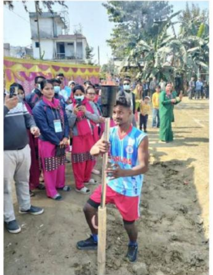
राष्ट्रपति रनिङ शिल्डमा मस्कट प्रदर्शनी

With a highly effective administration and a team of experienced teachers who are at all time ready to inspire the students and help them learn, Sukuna has been successful to position itself as the pioneer school in Koshi Province. I really found it the right place for a learner who aspires to acquire knowledge literally. I am proud to be a part Sukuna. I made a right choice to study in this institution that will lead me up to my goal. I strongly suggest the new faces to be a part of this well recognized institution.