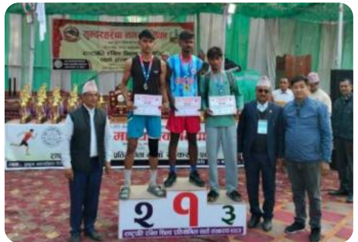
Winner in President Running Cup