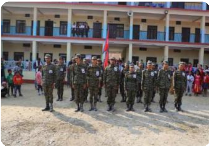
National Cadet Corps (NCC)