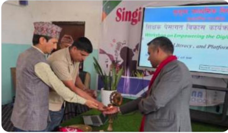
Training Inauguration Ceremony