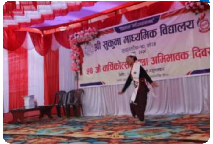
Students Perform in Parents Day